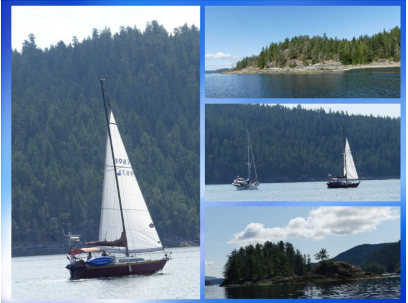
Saracen and Antares merrily sailing up Malaspina Inlet

Looking behind, I noticed some chopped up Styrofoam and a red shadow a half meter under the surface. I drifted for a while to assess and could not see anything floating out astern other than the Styrofoam bits. Eventually, I gently shifted into reverse to back off anything that might have been tied to the foam. Then after a length or so, I shifted into forward at an idle for a few seconds before drifting again, watching carefully on all sides. Seeing nothing, I contemplated having a cup of tea, but when another sailboat came up astern, I waved them over and asked if they could carefully drift past and see what they could see that might have gone clunk-clunk. Sure enough, they saw a line pulling down from behind our keel and into the deep. There was no sign of anything else. I tried backing up a few seconds and drifting, then forward a couple of seconds to drift and suddenly the engine stopped. OK, let's try a very brief reverse to untangle anything that might have caught the prop. The engine was even faster to stop this time.